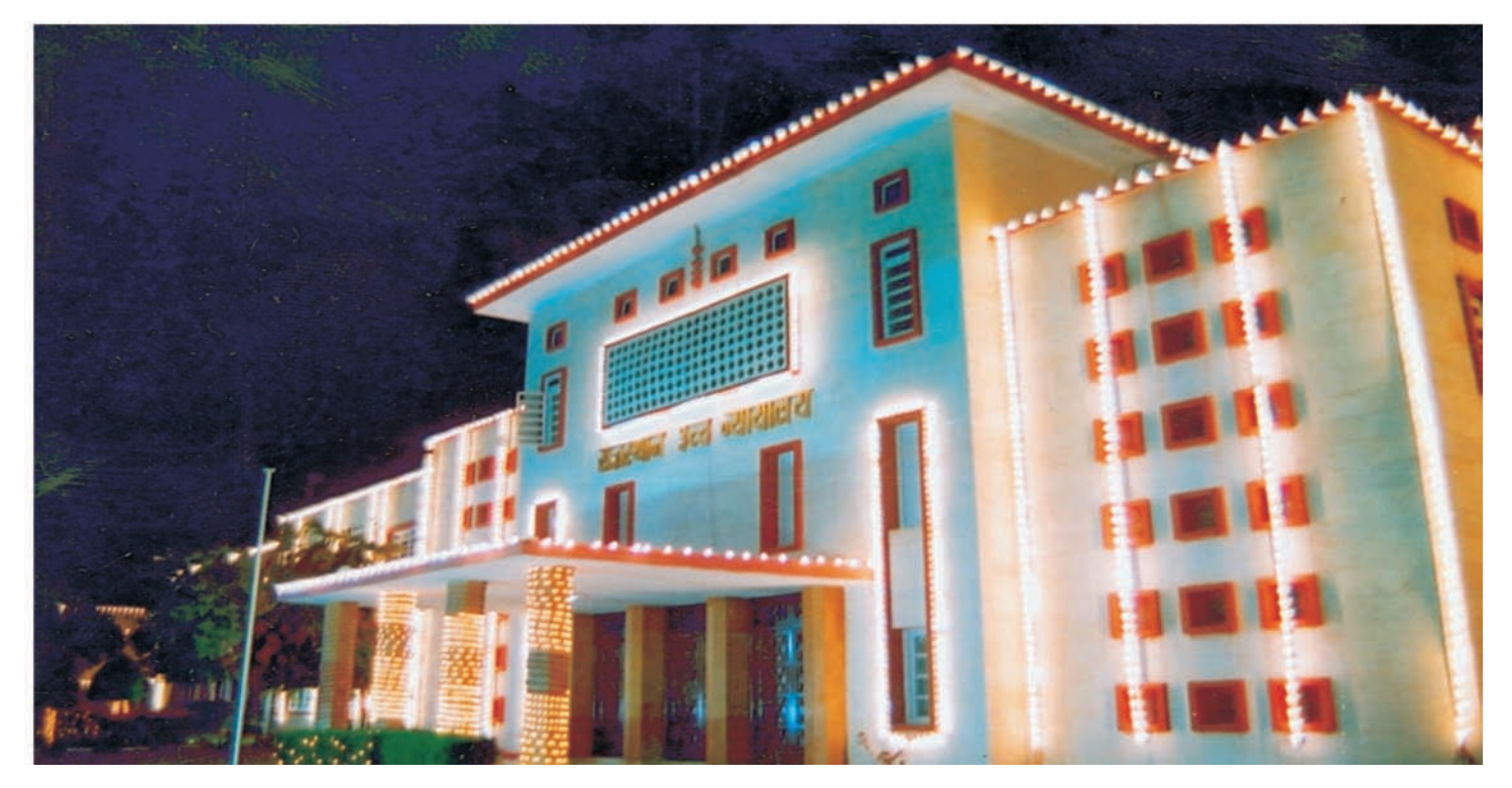
Rajasthan High Court Bench, Jaipur

A quarterly newsletter published by Rajasthan High Court