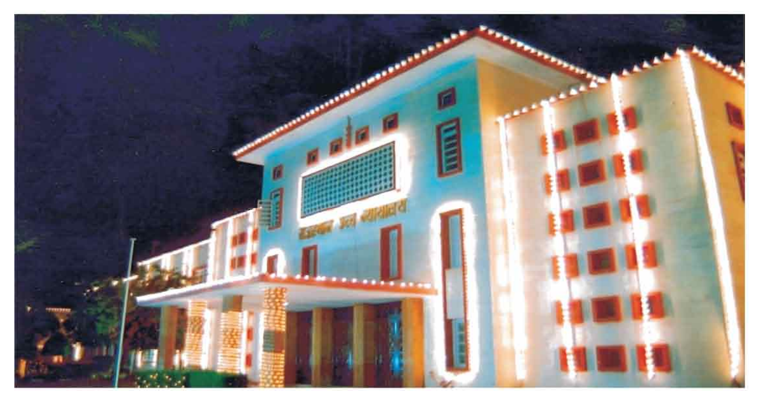
Rajasthan High Court Bench, Jaipur