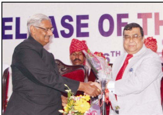
Hon'ble Mr. Justice Arun Mishra, Chief Justice Rajasthan High Court presenting bouquet to Hon'ble Mr. Justice Altamas Kabir, Judge Supreme Court on the occasion of inauguration of Rajasthan High Court Law Museum and Archives & Release of Rajasthan High Court News Letter on 26/02/2011 at Jaipur.