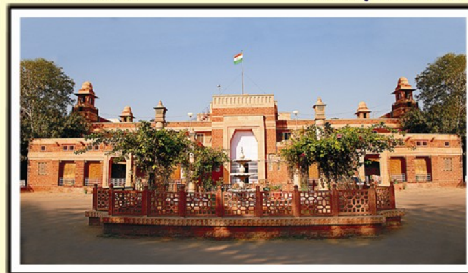
Rajasthan High Court, Principal Seat, Jodhpur