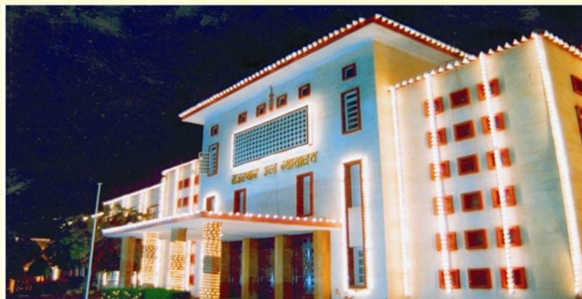
Rajasthan High Court Bench, Jaipur

A quarterly newsletter published by Rajasthan High Court