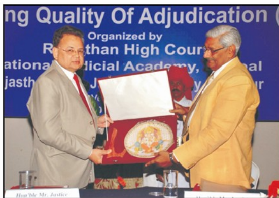
Hon'ble Mr. Justice Arun Kumar Mishra, Chief Justice Rajasthan High Court presenting the Memento to Hon'ble Mr. Justice Dalveer Bhandari, Judge Supreme Court.