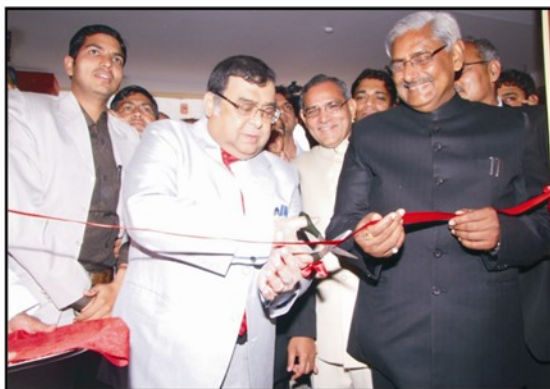
Hon'ble Mr. Justice Altamas Kabir, Judge Supreme Court and Hon'ble Mr. Justice Arun Kumar Mishra, Chief Justice Rajasthan High Court inaugurating Rajasthan High Court Law Museum and Archives on 26/02/2011 at Jaipur.