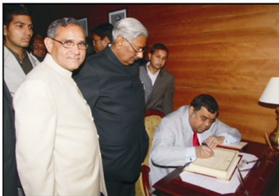
Hon'ble Mr. Justice Altamas Kabir, Judge Supreme Court writing in the Visitor's Book accompanied with Hon'ble Mr. Justice Arun Mishra, Chief Justice Rajasthan High Court and Hon'ble Mr. Justice Narendra Kumar Jain, Judge Rajasthan High Court at the Rajasthan High Court Law Museum and Archives on 26/02/2011 at Jaipur.