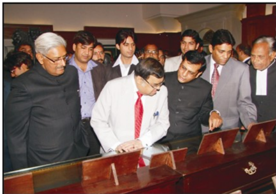
Hon'ble Mr. Justice Altamas Kabir, Judge Supreme Court, Hon'ble Mr. Justice Arun Mishra, Chief Justice Rajasthan High Court, viewing the Law Museum and Archives and Hon'ble Mr. Justice R.S.Chauhan, Judge Rajasthan High Court detailing about the Rajasthan High Court Museum on 26/02/2011 at Jaipur.