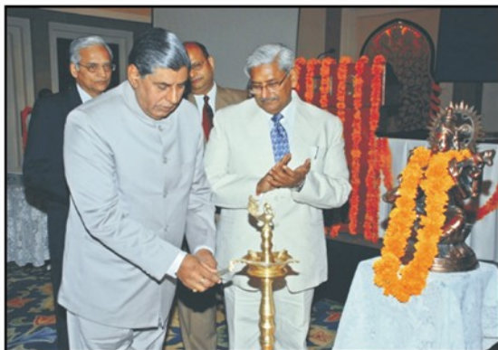
Hon'ble Dr. Justice B. S. Chauhan, Judge Supreme Court lighting the lamp at Inaugural ceremony of the West Zone Regional Judicial Conference on "Enhancing Quality of Adjudication" at Jaipur.