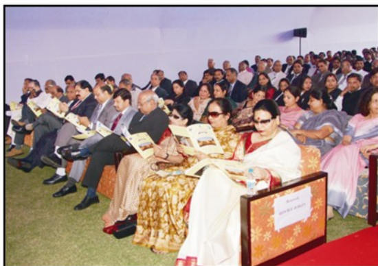
Hon'ble Judges of Rajasthan High Court, family members of Hon'ble Judges and distinguished guests browsing the Inaugural Issue of Rajasthan High Court News Letter after its release on 26/02/2011 at Jaipur.